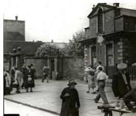
Mile End Road in 1921