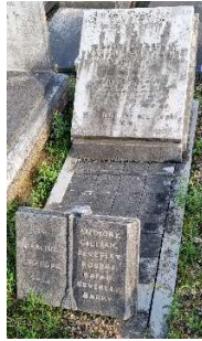
Emanuel Shine (1894 – 1960)