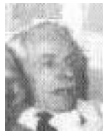
Joseph b: 1896