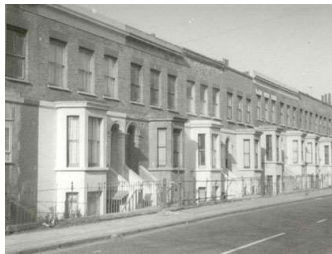
These terraced houses look like the ones in Libra Road as far as I can remember I don't know exactly where/when this picture was taken.