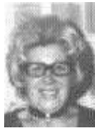
Bloomah b: 1908