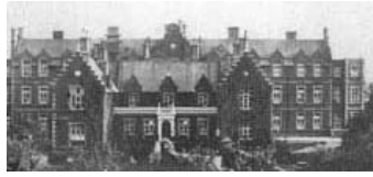
The German Hospital, Hackney