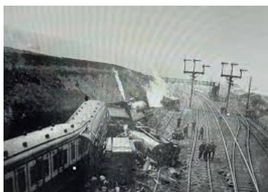
1923 Saddleworth Train Crash