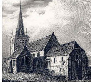
St. Mary's Church, Ely