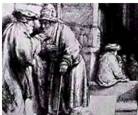
Ashkanzi Jews in Amsterdam

The Ashkenazi Jews arrived from North Western Europe and were far poorer than their wealthy Sephardi counterparts, who came mainly from Spain and Portugal. Indeed, The Sephardi Jews passed regulations restricting marriage and other involvements with the, perceived, socially inferior Ashkenazim. These poor Jews lived on the margins of the Sephardic community, relying on their charity, Synagogues etc and also for work. By the 18th century although the Ashkenazi Jews were far more established, they were still separate from the Sephardi Jews.